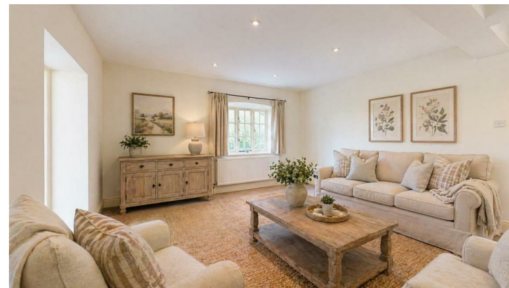
Annex Living Room

At the heart of the home lies a superb farmhouse kitchen, blending rustic charm with luxury finishes. Exposed beams sit above granite worktops, a traditional Belfast sink and an Aga range cooker, while a central island provides additional preparation space and room for under-counter refrigeration. Stone flooring completes the space with effortless style.